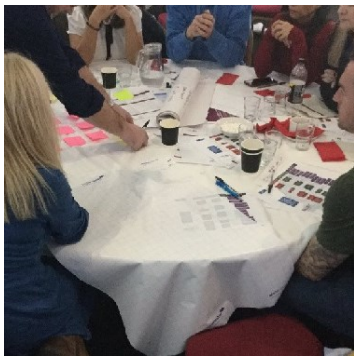
Process mapping in action