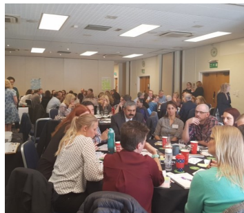
South West regional day

The aim of KQuIP is to enhance quality of life and clinical outcomes for people living with kidney disease by engaging the whole kidney multi-professional team in quality improvement, and enabling leadership.