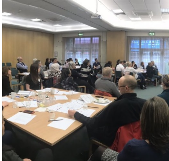
Yorkshire and Humber—MAGIC project launch